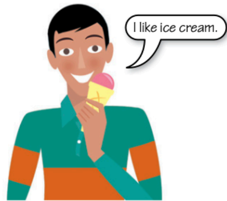
He's eating an ice cream. He likes ice cream.

They read / he likes / I work etc. = the present simple :