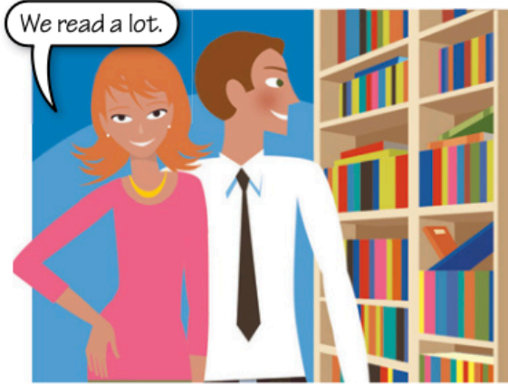
They have a lot of books. They read a lot.